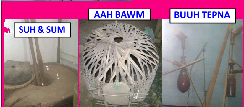
SUH & SUM